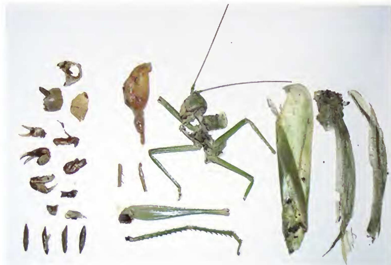
Fig. 15. Defecated prey remains from specimen MZB Lac. 5178 of Varanus sp. representing a large orthopteran ( Sexava sp., Tettigoniidae) and fragments of a crab.

tion of different age groups in the Talaud monitor lizards. While juvenile specimens seem to hide in thicket on the ground, adults obviously prefer a semi-arboreal life. The avoidance behaviour of juveniles seems reasonable because cannibalism is common in many monitor lizard species.